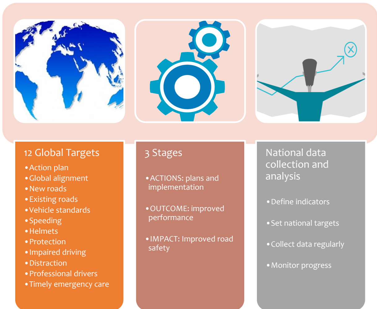
Figure 2. Summary of the key elements contained in this document